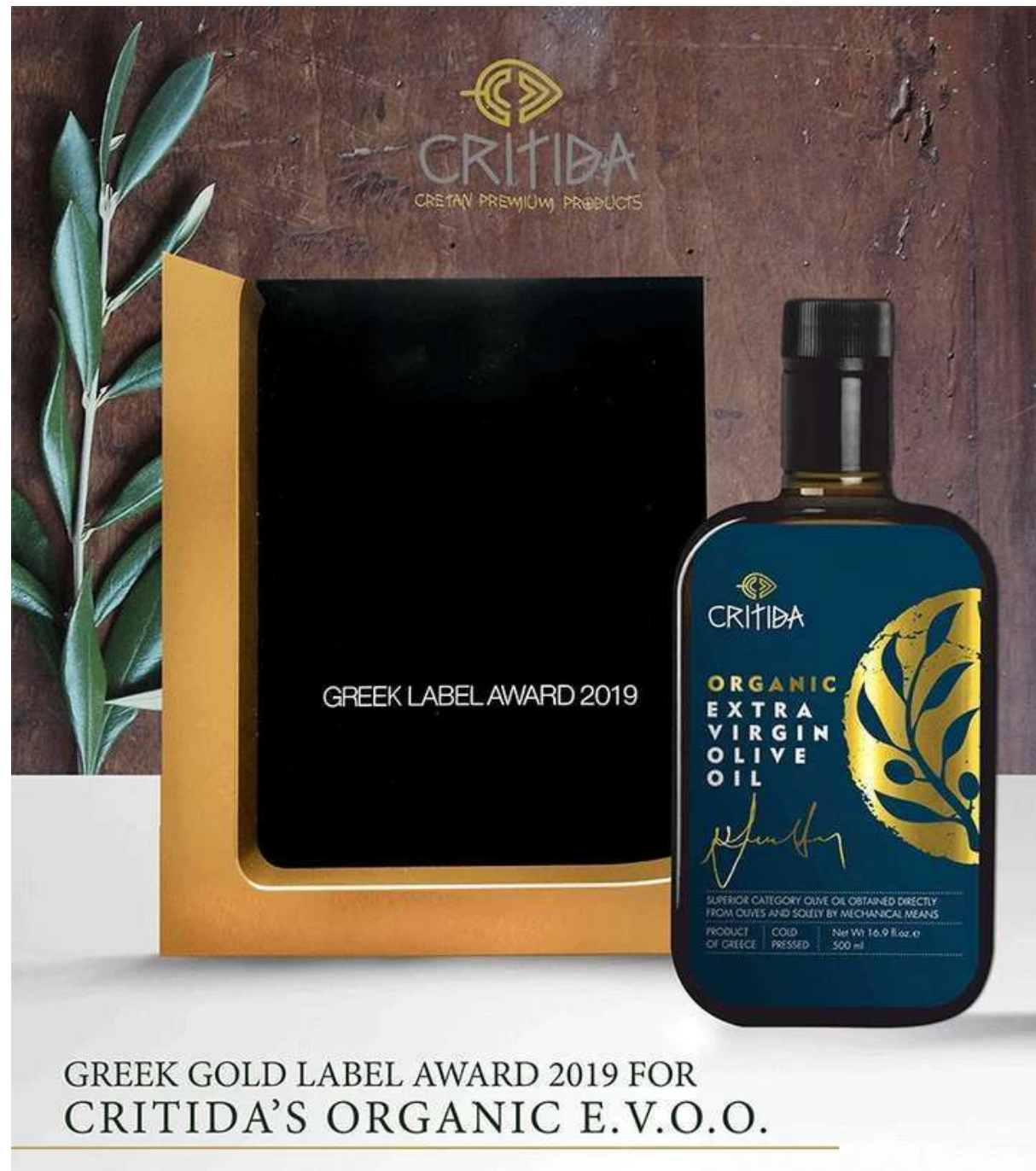
GREEK GOLD LABEL AWARD 2019 FOR CRITIDA'S ORGANIC E.V.O.O.